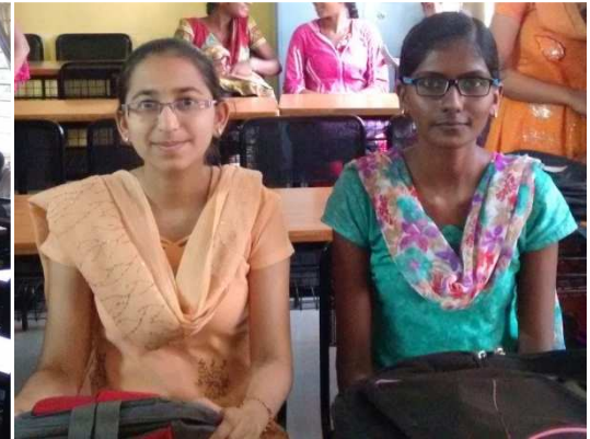
Winners of QnA '16