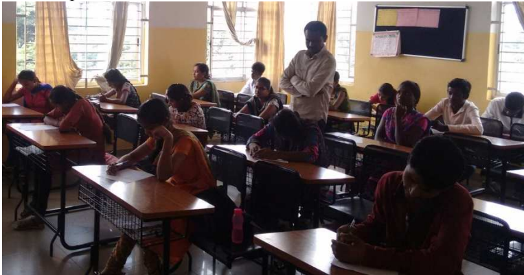
Quiz Written Prelims

The Quiz was conducted by our alumni - Kiran and Rajesh. It is heartening to see alumni taking up complete ownership.