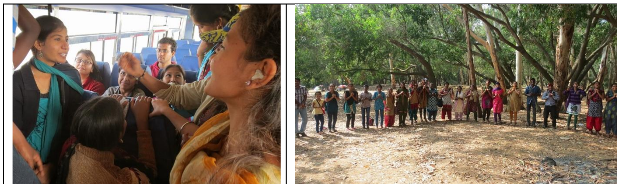
Figure 2: Annual Outing

The students were happy, however they felt they would have had more time if we could have started earlier.