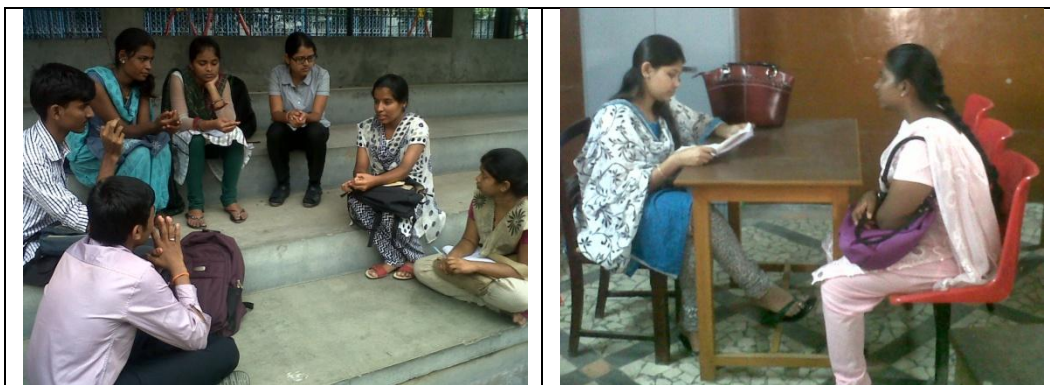
Figure 1: Students participating in Mock Interview

The interviews ended with 6 out of 21 students being offered a position. Individual feedback was given to all the students with respect to their performance in each of the rounds to identify and work on their weaknesses.