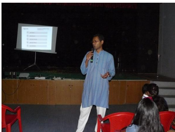
Figure 2: Annual Day Pictures